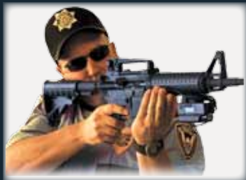
Shown with optional remote switch

Finally, PistolCam can be configured to stream video and record at the same time, making it perfect in a training environment.