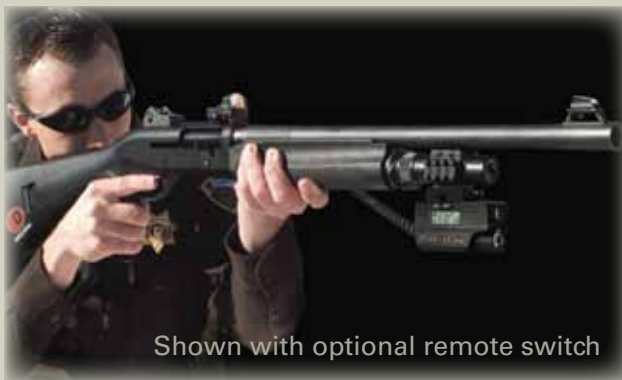
Shown with optional remote switch

Using different optional mounts and the optional remote switch, you can also use PistolCam on Rifles and Shotguns.