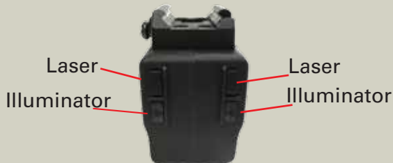
Right or Left Handed Controls